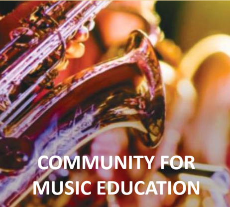
COMMUNITY FOR MUSIC EDUCATION