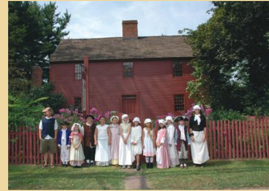
Noah Webster House

West Hartford Center has been the community's hub since the late 1600's. The unhurried atmosphere encourages you to park and walk along the tree-lined, brick sidewalks, and stop by the fine specialty shops, restaurants, and businesses. The area also offers seasonal outdoor dining and free concerts and special events at Blue Back Square.