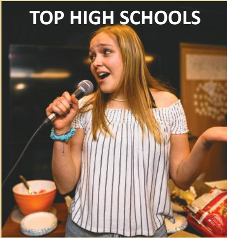
TOP HIGH SCHOOLS