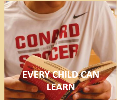
EVERY CHILD CAN LEARN